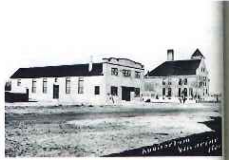
Original Cherry County Courthouse was built in 1901. The City Auditorium was built in 1913.