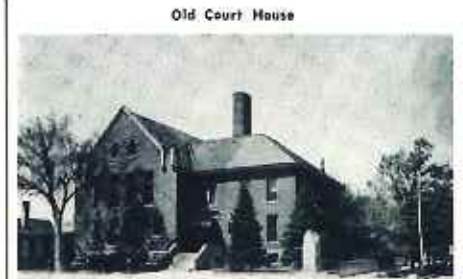
Original Cherry County Courthouse. The original home of the Valentine Public Library