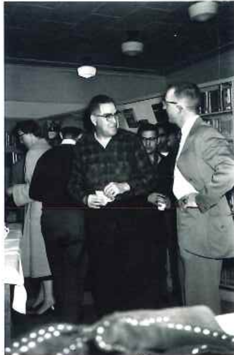
Businessman coffee event