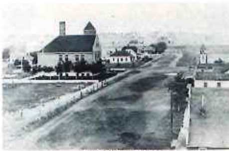
Valentine Main Street facing north. The original Cherry County Courthouse built in 1901 is on the left.