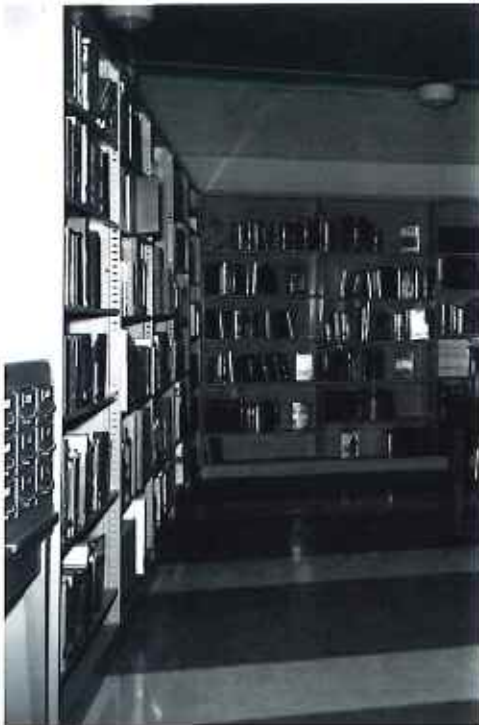
Valentine Public Library was located in the Valentine City Hall from 1938 until 1968